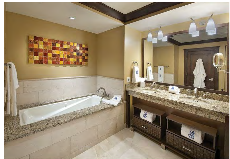
Luxurious baths with granite and marble counters and floors Dual sinks, Jetted Tub, and walk-in shower in master baths

This advertisement does not constitute an offer to sell real property. This information is provided in this advertisement is strictly for informational purposes and shall not be construed as an offer in California or any other jurisdictions where prior registration or other advance qualification of real property is required. This is not an offer to property to, or a solicitation of offers from, residents of any other state that requires prior registration or qualification of real estate. Prices are subject to change without notice. Obtain the Property Report or its equivalent, required by Federal and State law and read it before signing anything. No Federal or State agency has judged the merits or value, if any, of this property.