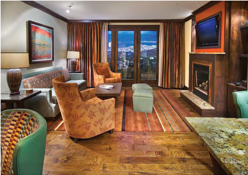
Wood Floors in Living Areas & Custom Designed Furnishings Gas Fireplace, G.E. stacking laundry