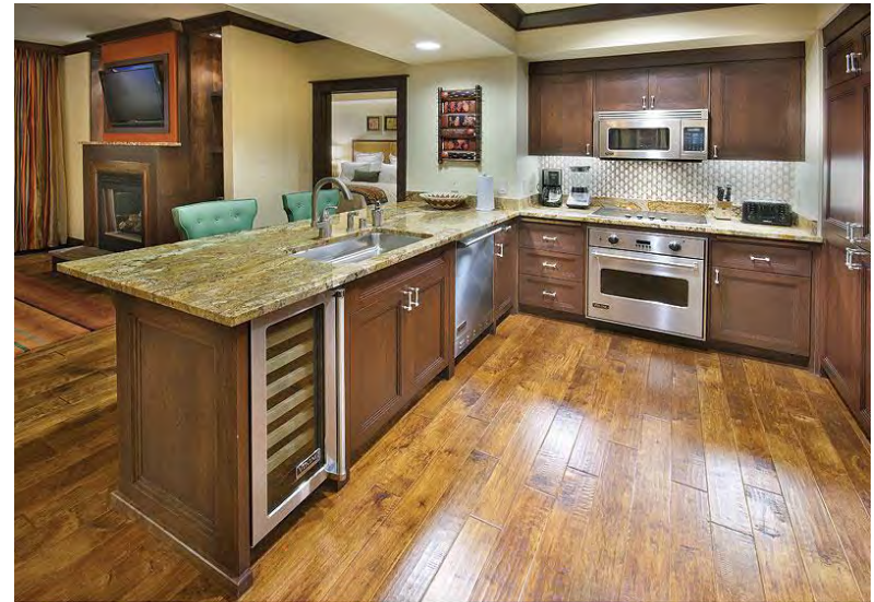
Spacious kitchens with granite counters and backsplash Viking Professional Appliances, including wine refrigerator