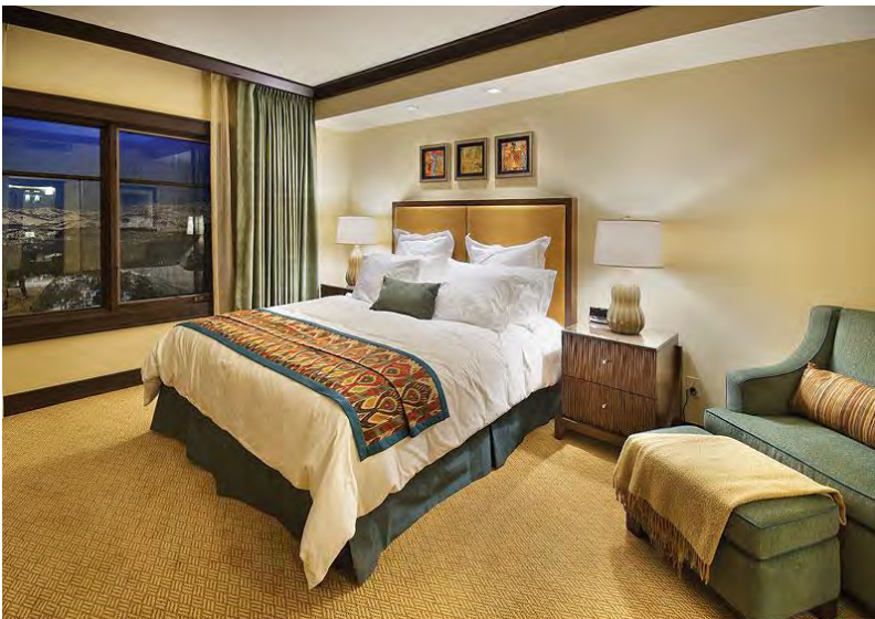
Comfortable furnishings, linens and spacious living areas Plentiful large windows to let the natural light in and enjoy the views